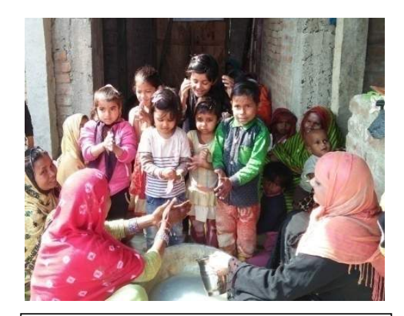
Hand wash practices among children