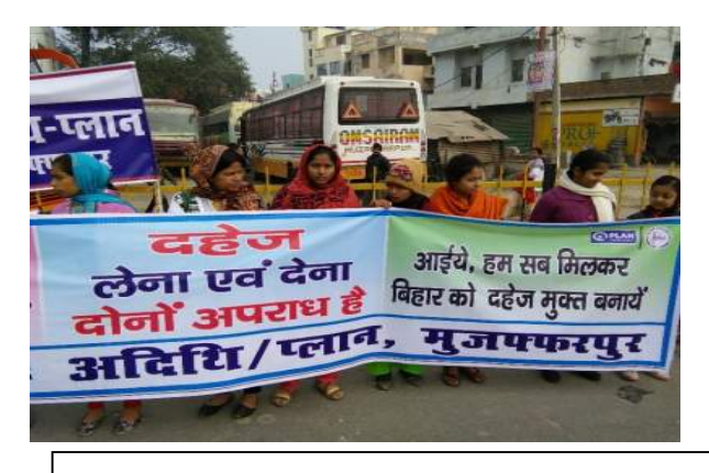
Human Chain Rally